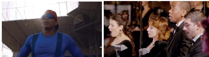
The Last Out, The Oratorio