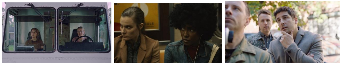
Drought, Materna, The Subject

Films in the Naples International Film Festival's competition categories will be vying for $5,000 in prizes, including the Audience Awards for Best Narrative Feature, Best Documentary Feature and Best Short. For the third year in a row, there will also be juried awards in the Narrative and Documentary Features categories.