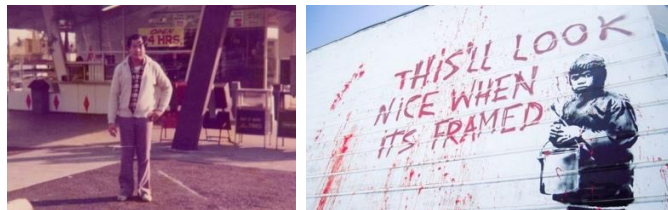
The Donut King, Banksy Most Wanted

SPECIAL OUTDOOR SCREENINGS WILL FEATURE ALICE GU'S AWARD-WINNING THE DONUT KING AS THE OPENING NIGHT SELECTION, WITH AURÉLIA ROUVIER AND SEAMUS HALEY'S FESTIVAL FAVORITE BANKSY MOST WANTED THE CLOSING NIGHT FILM