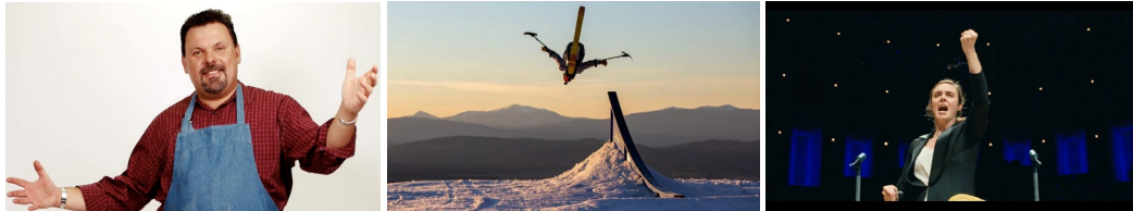
Art for Everybody, Full Circle, Maestra