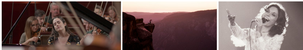
Pianoforte, Out There: A National Parks Story, Karen Carpenter: Starving for Perfection